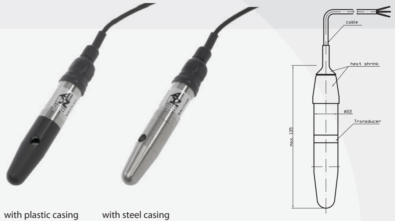
with plastic casing